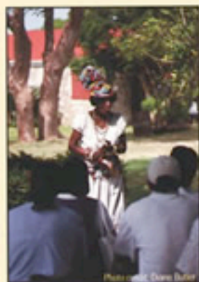
Colorful guides, colorful stories.